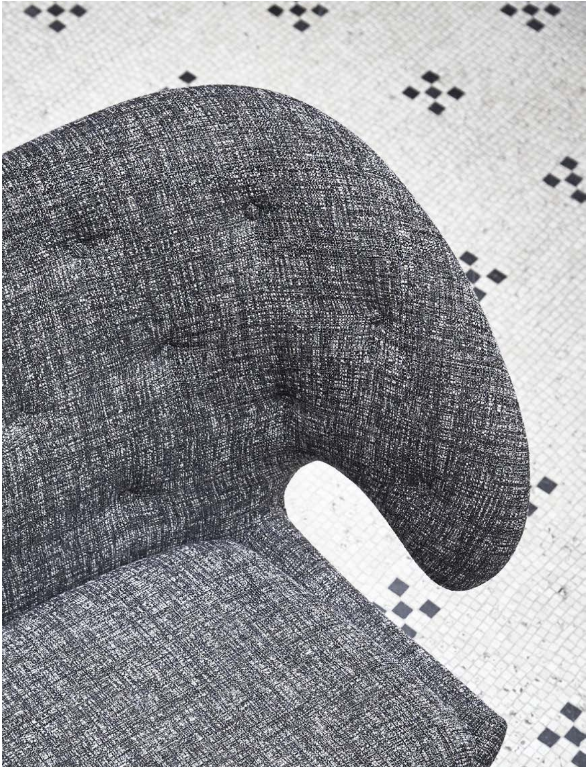
PELICAN CHAIR 1940 BY FINN JUHL —