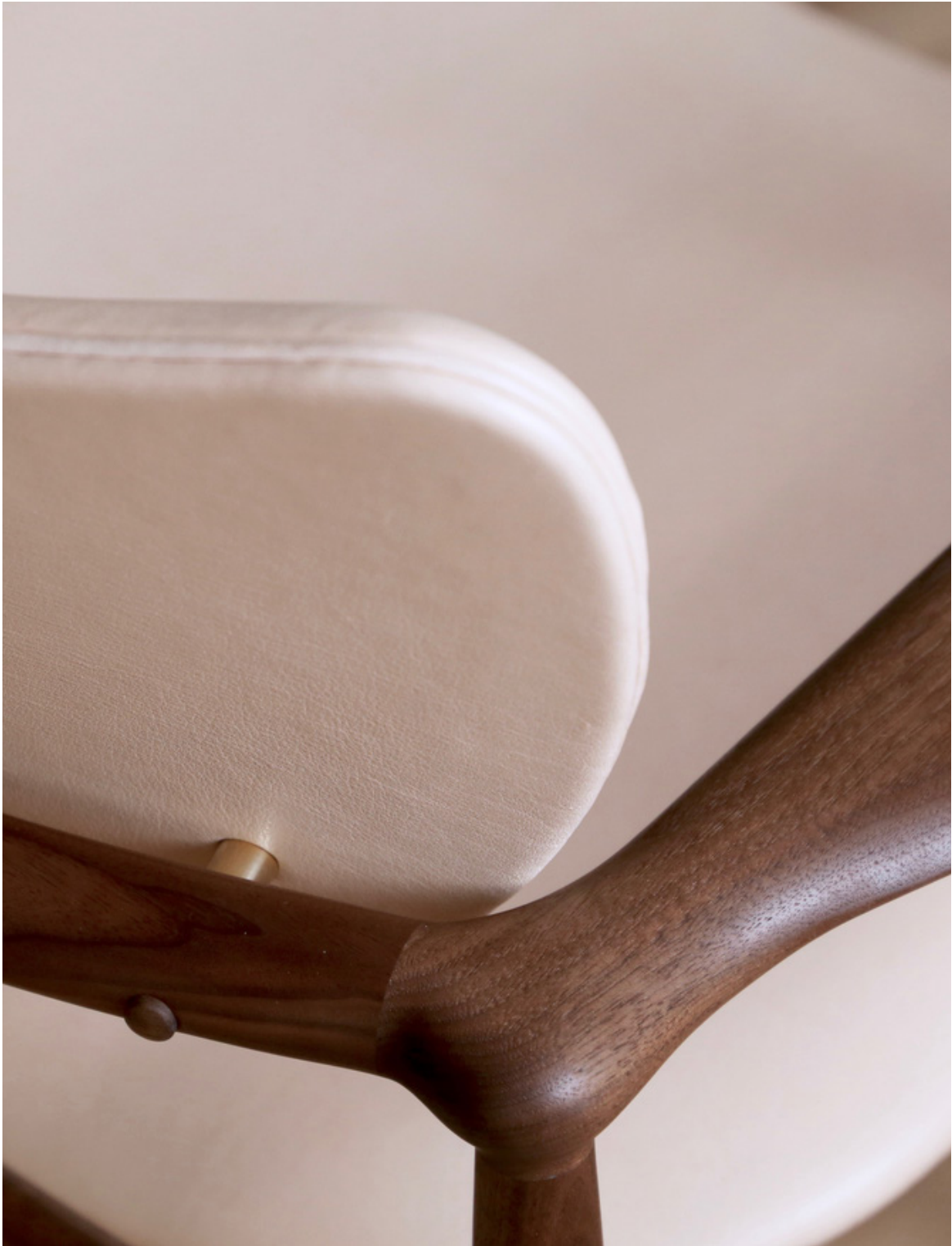
48 SOFA BENCH 1948 BY FINN JUHL