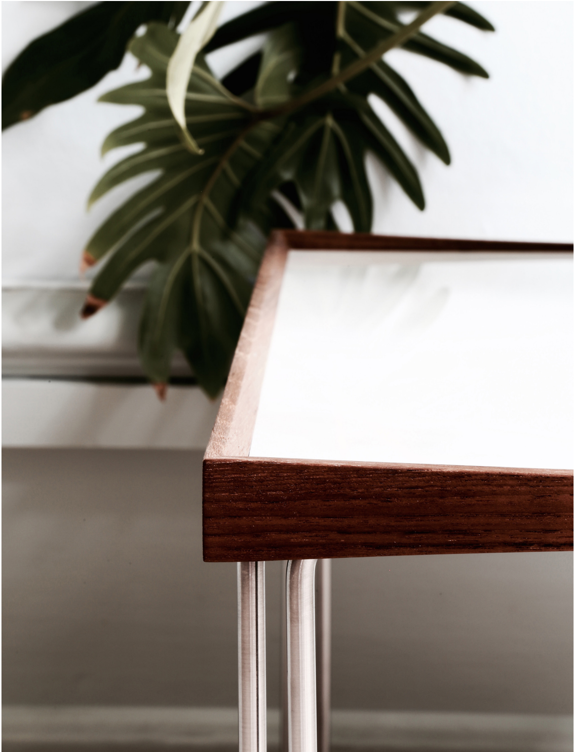
TRAY TABLE 1965 BY FINN JUHL